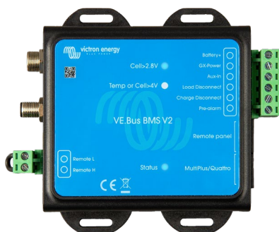
VE.Bus BMS V2