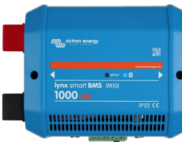
Lynx Smart BMS NG 1000A