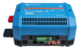
Lynx Smart BMS NG 1000A