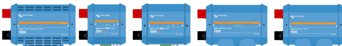
Lynx Distribution products with M10 busbars