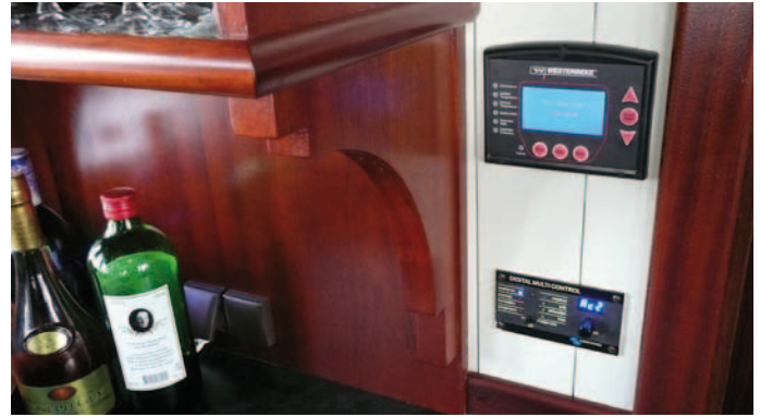
3 x 5Kw Quattro system